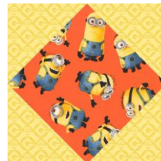
Diagonal Block — Make 13 each blue and orange