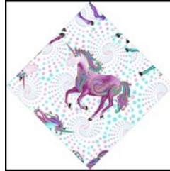
Pony Unit — Make 6

2. Sew a 6 \frac{1}{8} " solid white triangle to opposite sides of a pony print square. Press seams toward the square. Repeat, sewing triangles to the opposite sides of the square to make an 11" Pony Unit (trim unit if necessary). Repeat to make a total of (6) Pony Units.