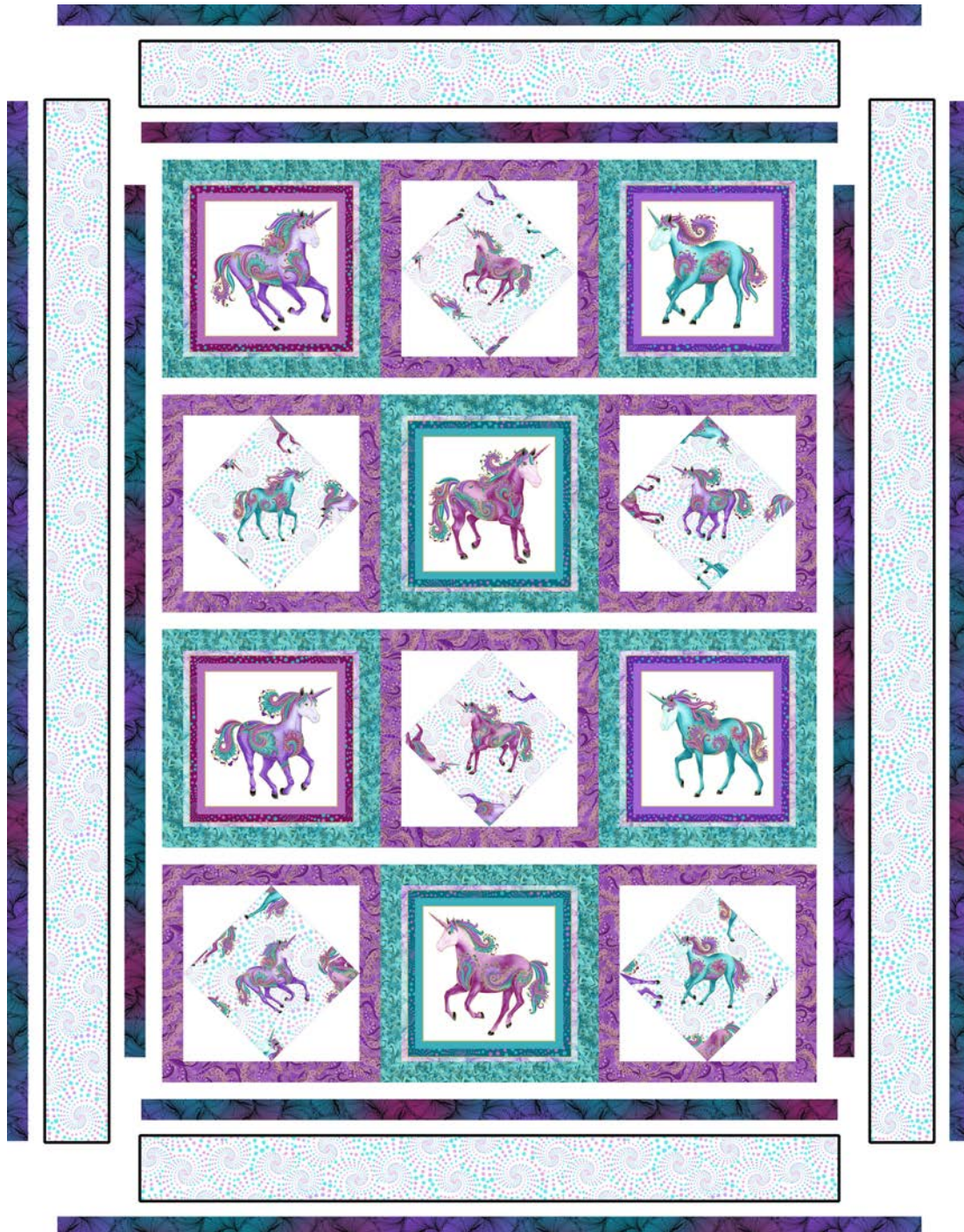
Exploded Quilt Diagram

9. Join the aqua bubbles print binding strips on the short ends with diagonal seams to make a long strip. Press seams open. Press the strip in half along the length with wrong sides together. Bind the quilt edges using your favorite method to complete the quilt.