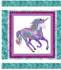
Teal Framed Block— Make 6

2. Sew a 6 \frac{1}{8} " solid white triangle to opposite sides of a pony print square. Press seams toward the square. Repeat, sewing triangles to the opposite sides of the square to make an 11" Pony Unit (trim unit if necessary). Repeat to make a total of (6) Pony Units.