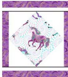
Purple Framed Block — Make 6

3. Sew a 1 \frac{3}{4} " x 11" purple tonal strip to the sides of each Pony Unit. Press seams toward the strips. Stitch a 1 \frac{3}{4} " x 13 \frac{1}{2} " purple tonal strip to the top and bottom. Press seams toward the strips. Repeat to make (6) Purple Framed Blocks.