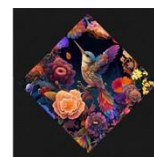
Floral Unit — Make 22