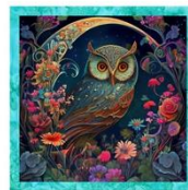
Panel Unit — Make 6