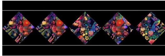
Long Border Unit — Make 2