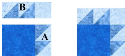
Paw Block — Make 8

5. Sew an A strip to 1 side of a 4\frac{1}{2} " dark blue square to make a 4\frac{1}{2} " x 6\frac{1}{2} " row. Press seam toward the square. Stitch a 2\frac{1}{2} " light blue square to the medium blue end of a B strip to make a 2\frac{1}{2} " x 6\frac{1}{2} " row. Press seam toward the square. Join the rows to complete (1) 6\frac{1}{2} " x 6\frac{1}{2} " Paw block. Press seam toward the bottom row. Repeat to make 8 blocks.