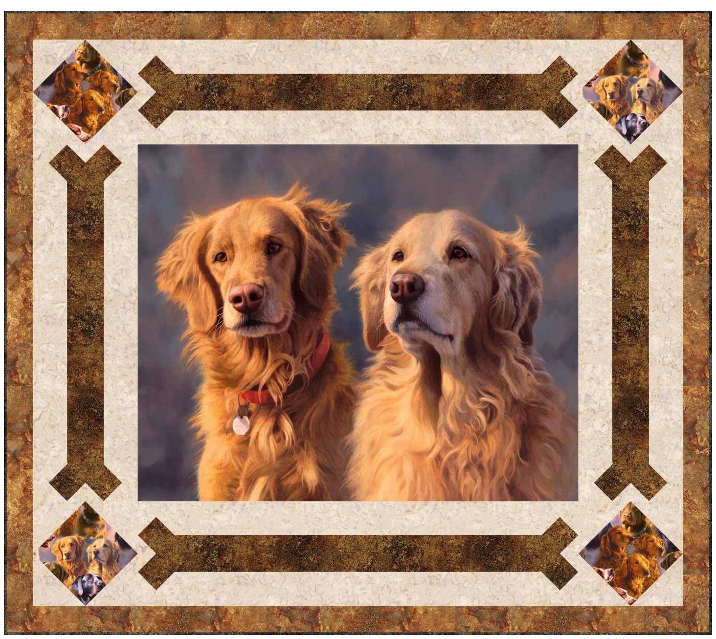
67" x 59"