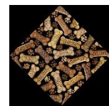
Dog bones Unit — Make 10