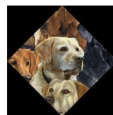
Retriever Unit — Make 12