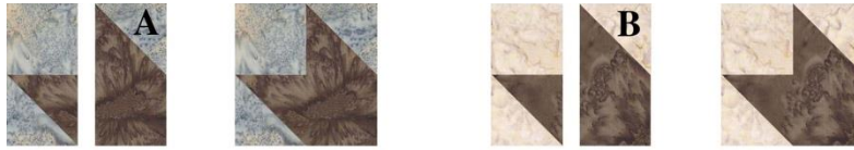
Quarter Units — Make 4 of each

5. Stitch an unmarked 2 1/2" gray square to 1 brown edge of each gray triangle unit to make (4) 2 1/2" x 4 1/2" pieced strips. Press seam toward the gray square. Add an A unit to each strip make (4) 4 1/2" x 4 1/2" gray quarter units. Press seam toward the A unit. Repeat with unmarked cream squares and units to make 4 cream quarter units.