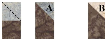
A & B Units — Make 4 of each