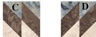
C & D Units — Make 4 of each