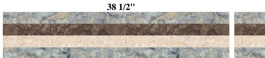
Border Unit — Make 4

7. Stitch a 2 1/2" x WOF brown strip to a 2 1/2" x WOF cream strip. Press seam to the brown side. Add 2 1/2" x WOF gray strips to the long edges to complete (1) 8 1/2" x WOF strip set. Press seams toward the brown strip and away from the cream strip. Repeat to make 4 strip sets. Trim each strip set to 38 1/2" to make (4) 8 1/2" x 38 1/2" border units.