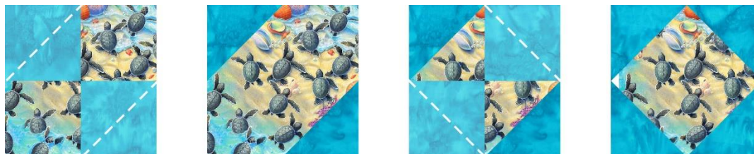
Turtle Unit — Make 8