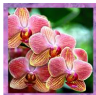
Framed Orchid Block — Make 10

2. Draw a diagonal line on the wrong side of each 4 1/4" medium blue square. Referring to the diagrams on the next page, place a marked square right sides together on 1 corner of an 8" orchid print square. Sew on the marked line. Trim seam allowance 1/4" from the stitching. Press the medium blue triangle open. Repeat on the remaining corners of each square to complete (10) 8" x 8" On-Point blocks.