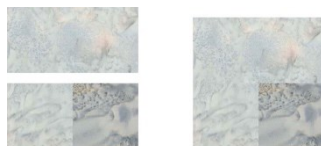
Corner Unit — Make 4

1. Sew a 3" light gray square to a 3" medium gray square to make a 3" x 5 1/2" strip. Press seam toward the light gray square. Stitch a 3" x 5 1/2" light gray rectangle to 1 long side to make a 5 1/2" x 5 1/2" corner unit. Press seam toward the rectangle. Repeat to make 4 corner units.