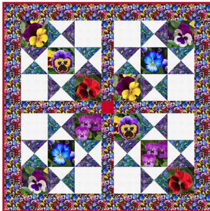
50-1/2" x 50-1/2"

Elizabeth's Studio LLC 440 S. Main Street, Milltown NJ 08850 732-651-4115 www.elizabethsstudio.com