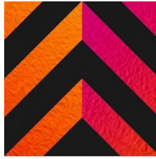
Chevron Block — Make 12