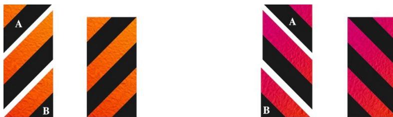
Half-Blocks — Make 12 of each color

8. Sew a gold A triangle unit to the gold edge of each gold angled unit. Press seams toward the A units. Add a gold B triangle unit to the black edge to complete (12) 6\frac{1}{2} " x 12\frac{1}{2} " gold half-blocks. Press seams away from the B units. Repeat with pink A and B triangle units and angled units to make 12 pink half-blocks except press the top seam toward the angled unit and the bottom seam toward the B unit.