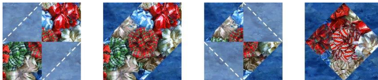
Corner Block — Make 4