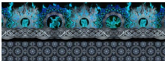
Pieced Border Strip (Make 2 – 34 1/2" and 2 – 40 1/2")