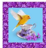
Framed Panel Unit — Make 16