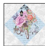
Pink Paris Unit — Make 14