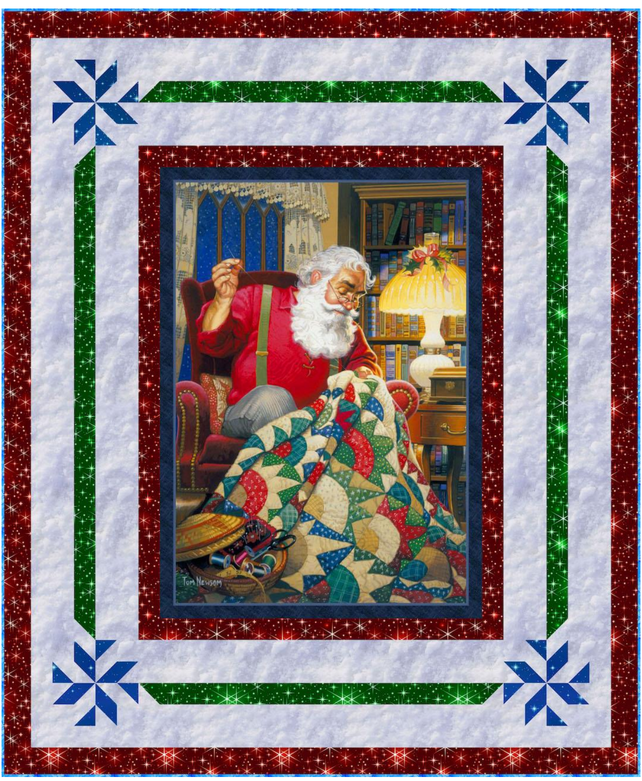
59" x 71"