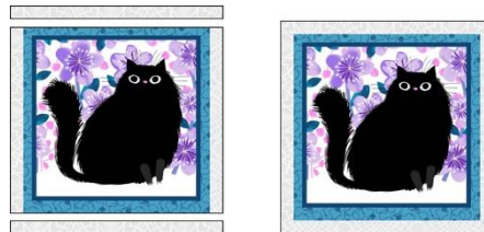
Panel Unit — Make 12