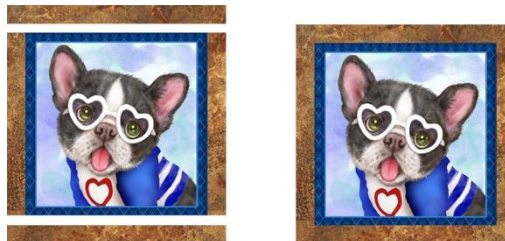
Puppy Block — Make 12