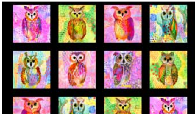
MAJO 164 MU*

Fabric Collection by KG Art Studio for P&B Textiles