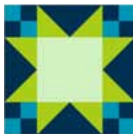
Figure 6 B Block, make 6.

6. Repeat step 5 with the remaining A Units, the C Units, and the remaining owl blocks to make six B blocks (Figure 6).