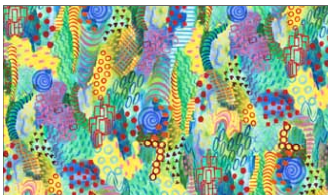
MAJO 167 MU*