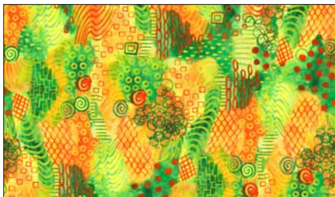
MAJO 166 MU*