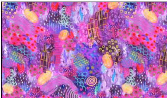
MAJO 165 MU*