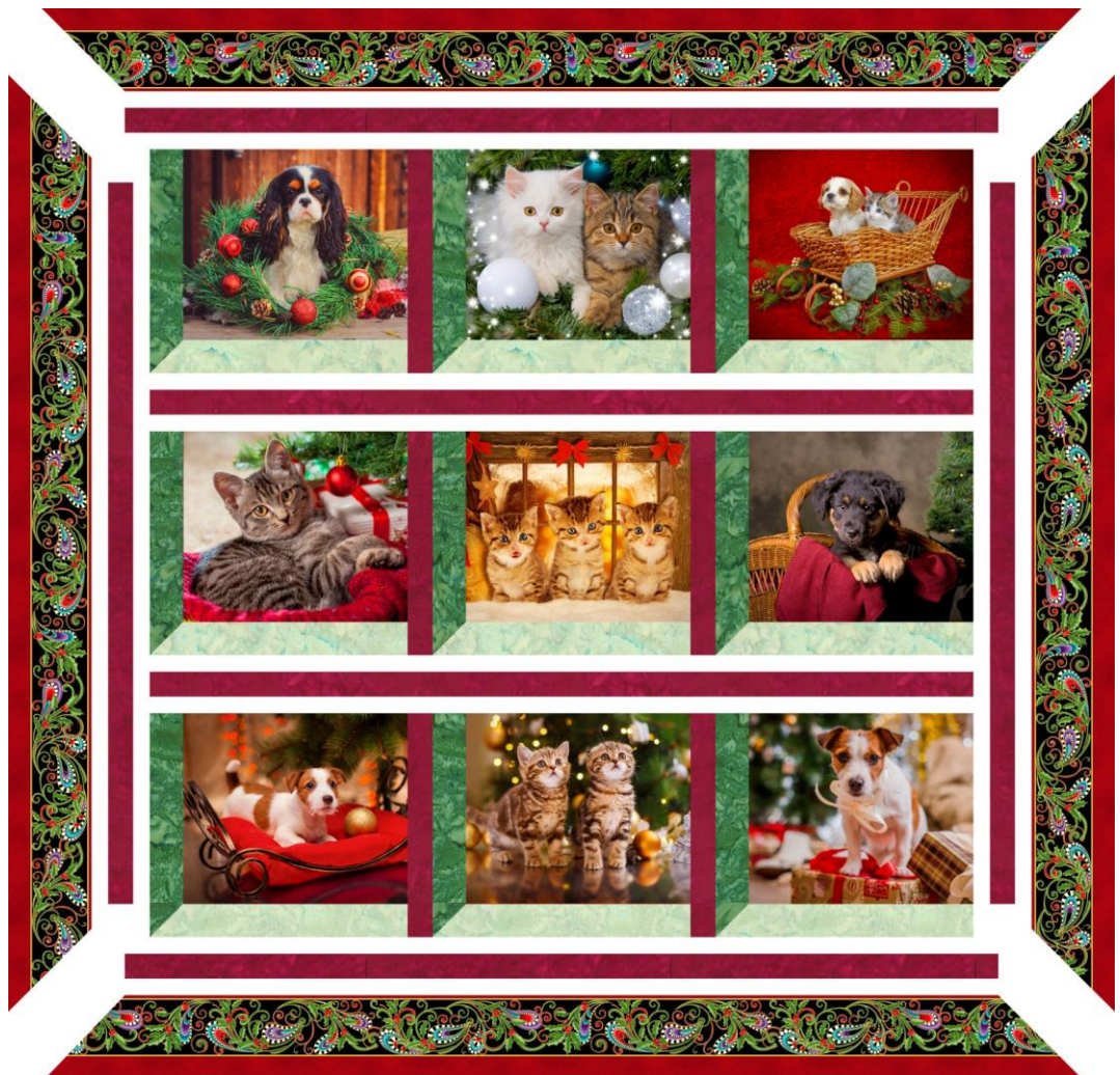
Exploded Quilt Diagram

9. Join the dark green hand-dye binding strips on the short ends with diagonal seams to make a long strip. Trim seam allowance to 1/4". Press seams in one direction. Press the strip in half along the length with wrong sides together. Bind the quilt edges using your favorite method to complete the quilt.