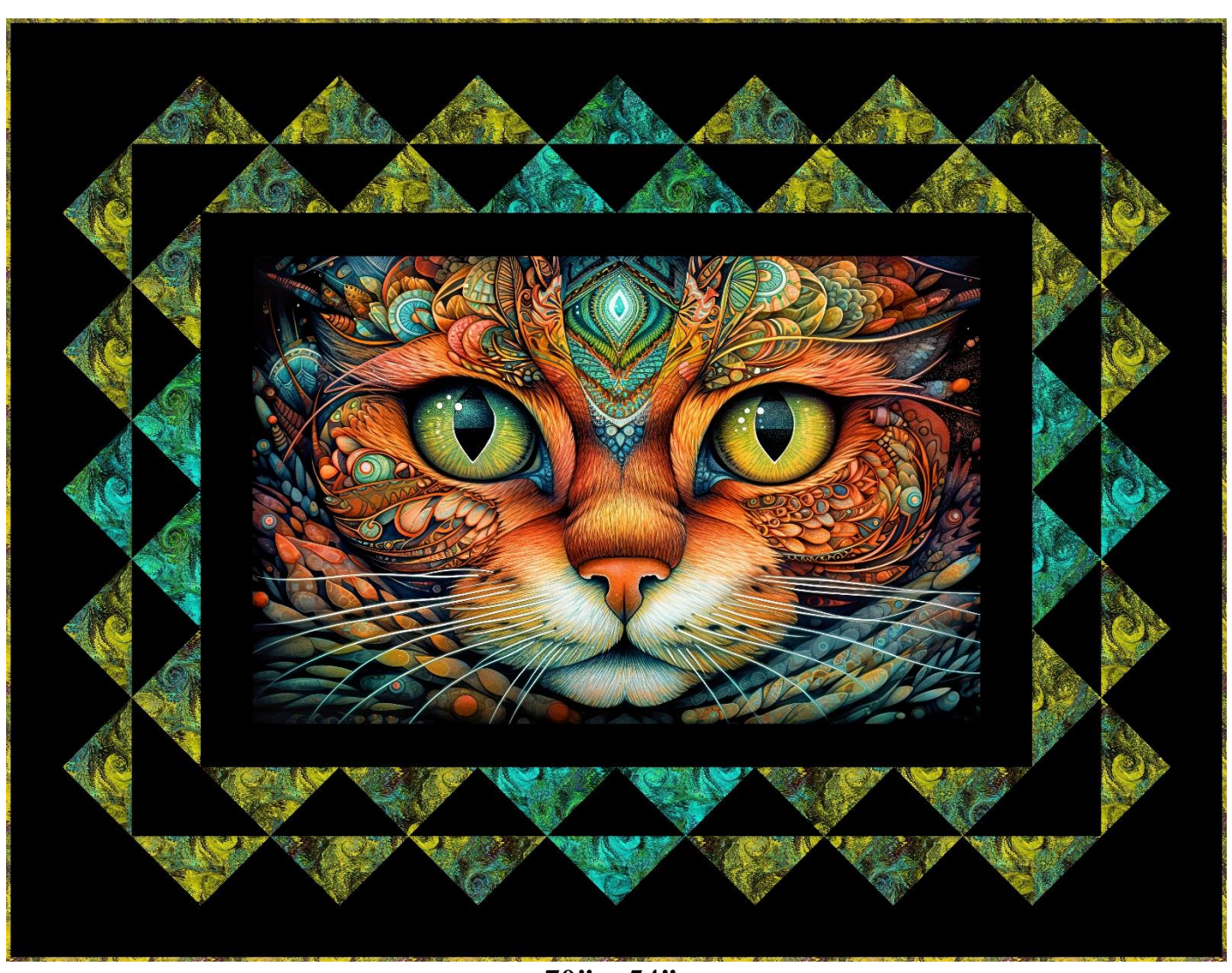
70" x 54"