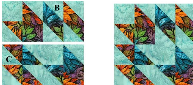
Corner Block — Make 4

6. Sew a double-B unit to a point unit to make a 5 1/2" x 10 1/2" row. Press seam toward the point unit. Repeat with a double-C unit and a point unit to make a second row. Join the rows to complete (1) 10 1/2" x 10 1/2" Corner block. Press seam down. Repeat to make 4 blocks.