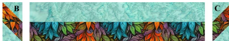
Strip Unit — Make 2 each short & long

8. Sew a B unit to 1 end and a C unit to the remaining end of each pieced strip to make 2 each 5 1/2" x 27 1/2" short strip units and 5 1/2" x 40 1/2" long strip units. Press seams toward the pieced strips.