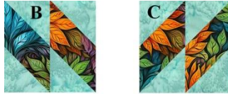
Double Units — Make 4 of each

5. Join 2 B units to make a 5 1/2" x 5 1/2" double-B unit. Press seam to the left. Repeat to make 4 units. Repeat with C units to make 4 double-C units.