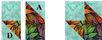
Point Unit — Make 8

4. Stitch a 3" unmarked sage square to each D unit to make 3" x 5 1/2" D strips. Press seam toward the square. Sew an A unit to each D strip to make (8) 5 1/2" x 5 1/2" point units. Press seam toward the A unit.