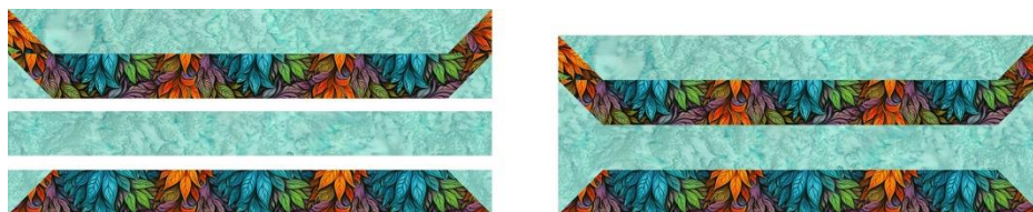
Border Unit — Make 2 each short & long

10. Stitch a same-length sage strip and then a same-length angled vines strip to each short strip unit to make (2) 10 1/2" x 27 1/2" short border units. Press seam toward the aqua strips. Repeat with long strip units and same-length sage and angled vines strips to make (2) 10 1/2" x 40 1/2" long border units.