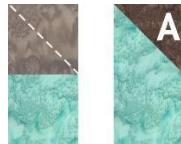
Angled Strips — Make 4