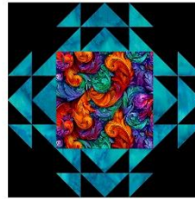
Garden Block — Make 4