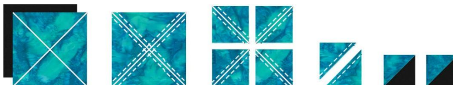
Triangle Units — Make 128