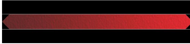
Border Unit — Make 2 each long & short