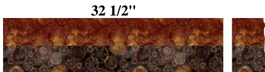
Side Unit — Cut 2