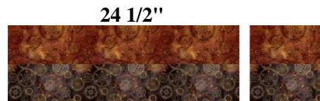
Top/Bottom Unit — Cut 2