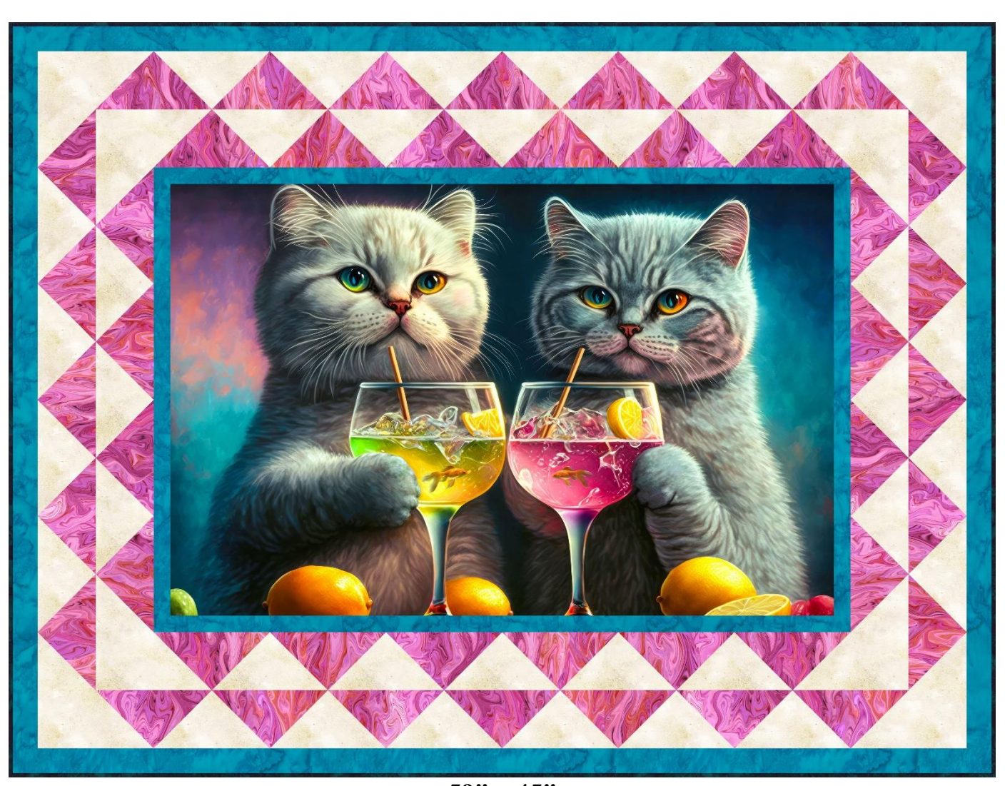
59" x 45"