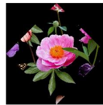
Corner Unit — Make 4