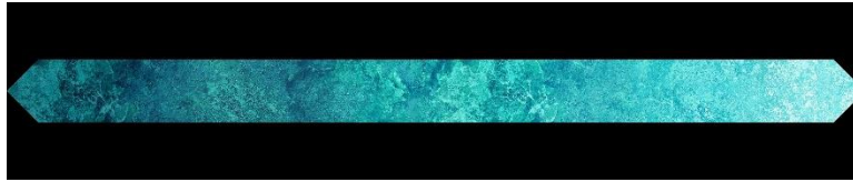
Border Unit — Make 4