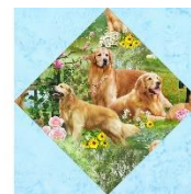
Corner Blocks — Make 4