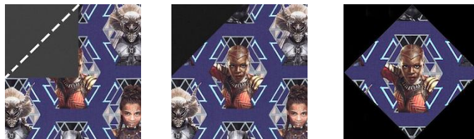
Character Block — Make 14

2. Place a marked square right sides together on 1 corner of a character square. Sew on the line. Trim seam allowance 1/4" out from the stitching. Press the black triangle open. Repeat on each corner of the square, paying close attention to the positioning of the diagonal seam lines, to complete (1) 6 1/2" x 6 1/2" Character block. Repeat to make 14 blocks.