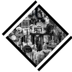
Cat Block — Make 6