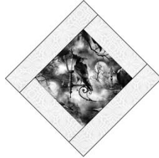
Bird Block — Make 6

2. Repeat step 1 using 2\frac{1}{4} " x 6\frac{1}{2} " and then 2\frac{1}{4} " x 10" white strips and the bird squares to make (6) 10" x 10" Bird blocks.