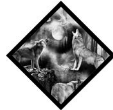
Wolf Block — Make 6

2. Repeat step 1 using 2\frac{1}{4} " x 6\frac{1}{2} " and then 2\frac{1}{4} " x 10" white strips and the bird squares to make (6) 10" x 10" Bird blocks.