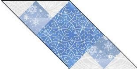
Blue Snowflake Unit — Make 8