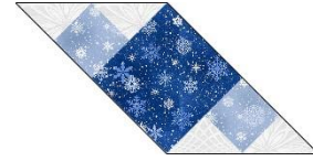
Dark Blue Unit — Make 12