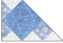
End Unit — Make 8

4. Stitch edge units to opposite sides of the remaining 4" blue snowflakes squares to make 8 blue snowflake border units. Press seams toward the edge units. Repeat with the remaining edge units and 4" dark blue snowflakes squares to make 12 dark blue border units.