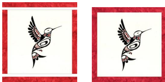
Pacific Northwest Block — Make 9