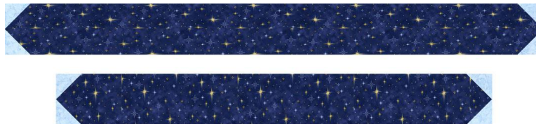
Long & Short Border Units — Make 2 of each

8. Repeat step 2 with the remaining marked 1\frac{1}{2} " light blue squares on each corner of the 4\frac{1}{2} " x 42\frac{1}{2} " and 4\frac{1}{2} " x 34\frac{1}{2} " navy strips to make 2 each long and short border units except press seams toward the navy strips.