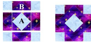
Center Unit — Make 4

remaining B units to make (8) 1 1/2" x 4 1/2" top/bottom strips. Press seams toward the squares. Sew the center strips between top/bottom strips to make (4) 4 1/2" x 4 1/2" center units. Press seams toward the top/bottom strips.