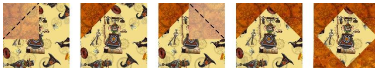
Gold Block — Make 8

2. Place a marked square right sides together on 1 corner of a 6 1/2" gold square. Sew on the line. Trim seam allowance 1/4" out from the stitching. Press the orange corner open. Repeat on the remaining corners of the gold square to complete (1) 6 1/2" x 6 1/2" Gold block. Repeat to make 8 Gold blocks.