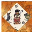
Cream Block — Make 6