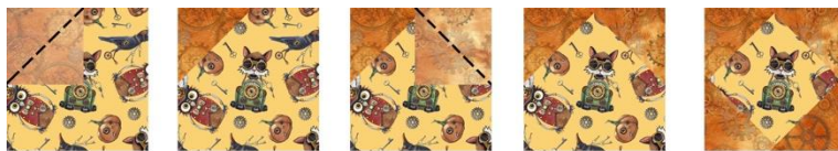
Gold Block — Make 8