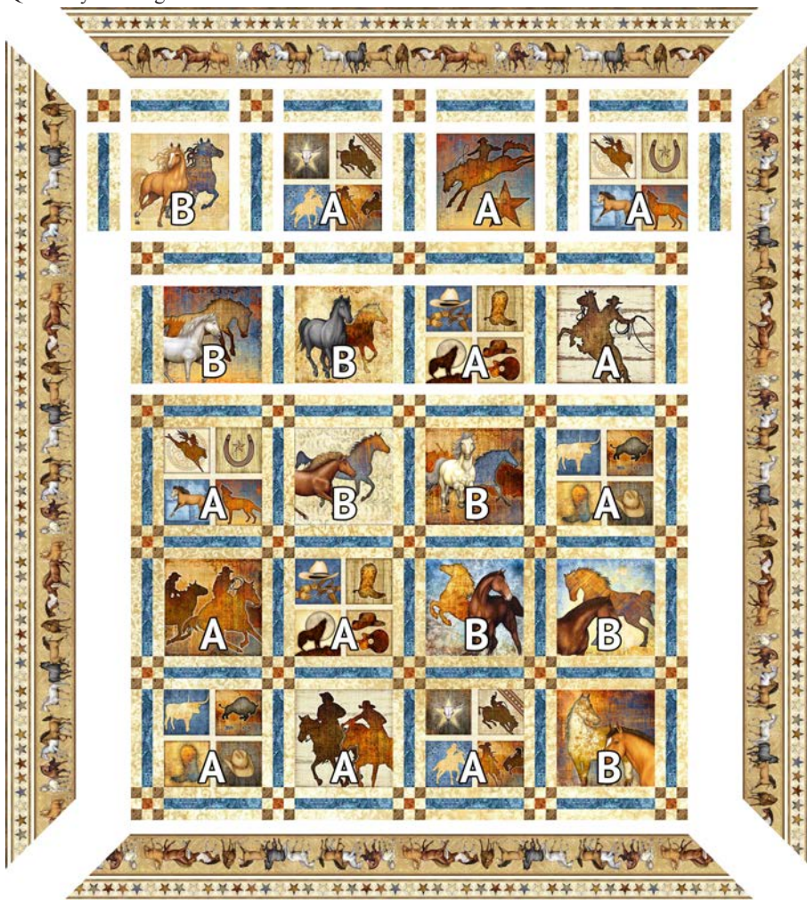
Quilt Layout Diagram

While all possible care has been taken to ensure the accuracy of this pattern, we are not responsible for printing errors or the way in which individual work varies.