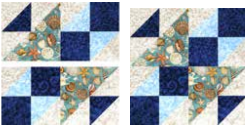
Kissing Fish Block - Make 4