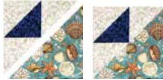
Fish Unit - Make 8