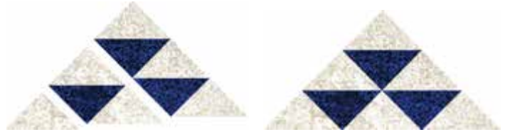
Pieced Triangle - Make 20