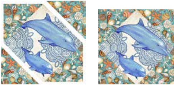
Dark Diagonal Square Block - Make 4