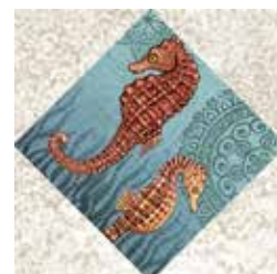
Light Diagonal Square Block - Make 4