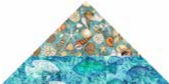
Stripe Triangle - Make 20