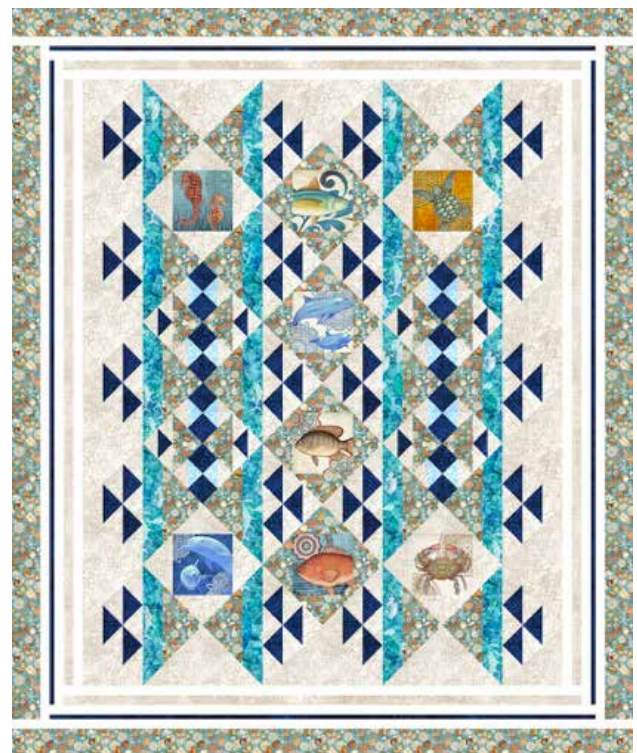
Exploded Quilt Diagram