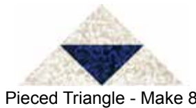
Pieced Triangle - Make 8