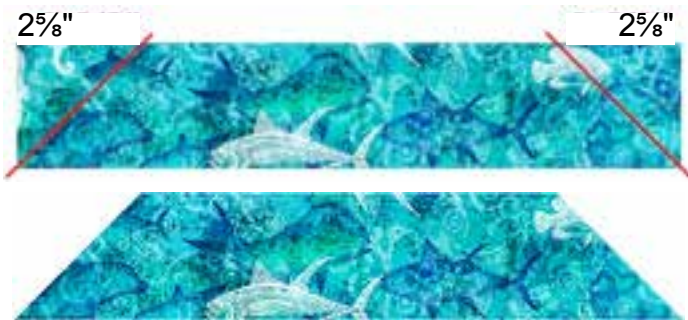
Angled Strip - Make 20