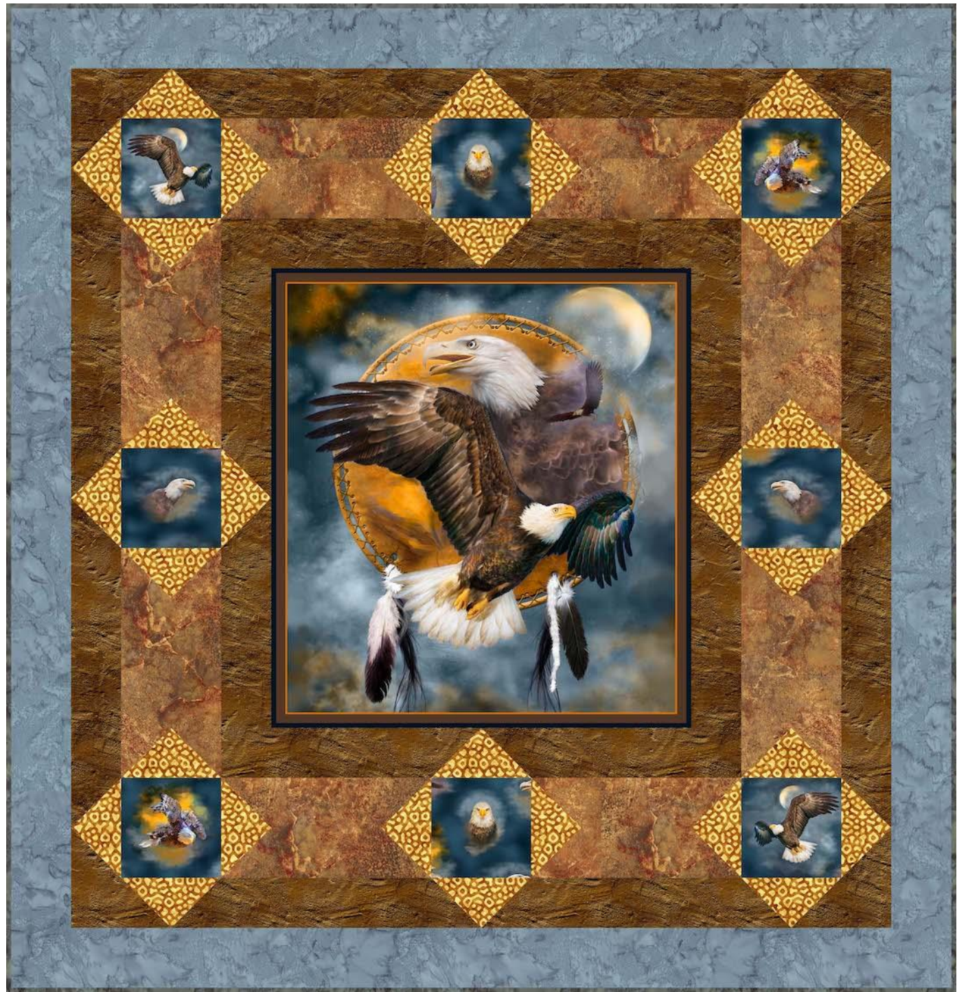
47" x 49"